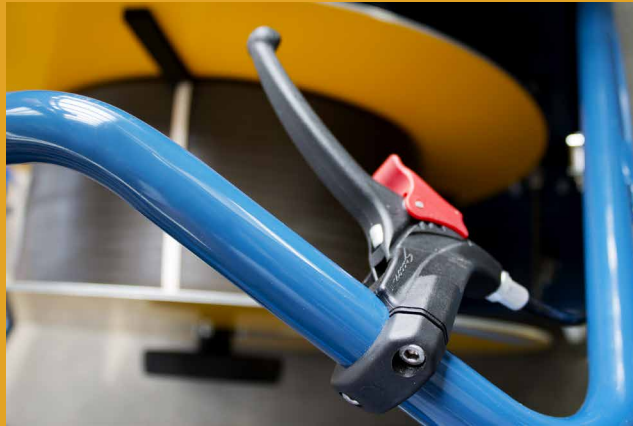
Brake lever to prevent unwanted movements.